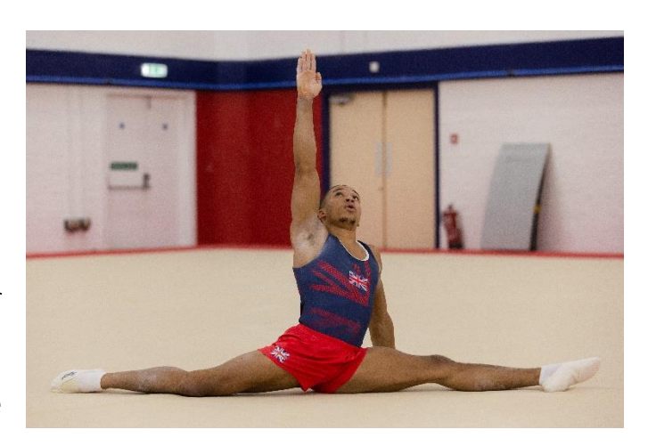
Joe Fraser in Training

Model provides even more comfort and performance thanks to components that make it versatile enough for all levels of gymnastics. Scientifically designed, this innovative exercise floor is the result of extensive research and development to satisfy and accommodate the performance needs of today's elite gymnasts.